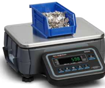
75 lb (35 kg) Model 9 in x 12 in (230 mm x 305 mm) platter