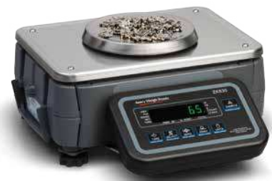
10 lb (5 kg) and 2 lb (1 kg) Models 6 in (150 mm) round platter