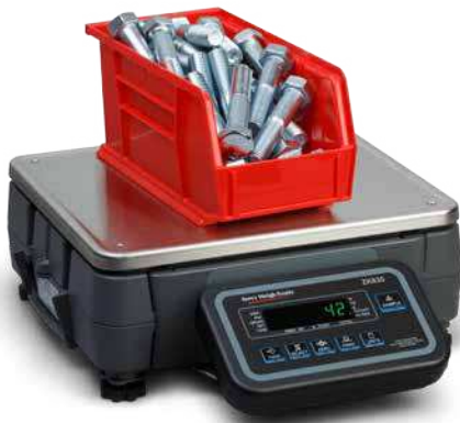
175 lb (80 kg) Model 12 in x 14 in (305 mm x 355 mm) platter

The ZK830 is available with a wide range of capacities from 1 lb up to 175 lb (500g to 80kg) - meeting most application requirements. A high precision scale offering 100,000 divisions (non legal-for-trade) or 10,000 divisions NTEP, OIML and Measurement Canada legal for trade is available.